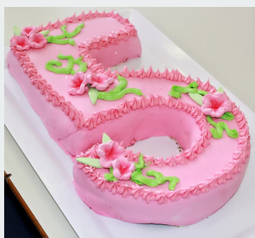
The final result - any five-year-old girl's dream cake.