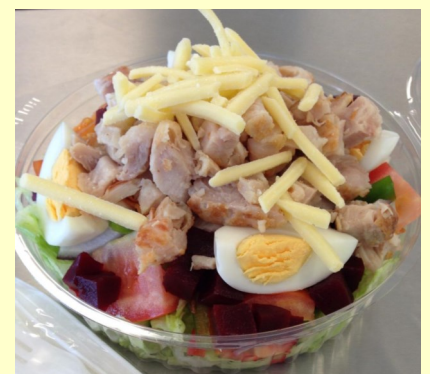
Ham Salad & Chicken Salad —$6.50 with egg—$7.00