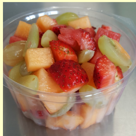
Fruit Salad $5 large, $3 small