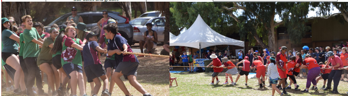
ADDITIONAL PHOTOS FROM SPORTS DAY

This is a list of current assessment tasks, due dates and grades